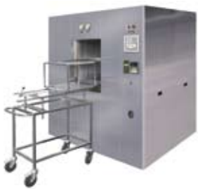
Large sterilizers for various industries and market needs

Featuring Tuttnauer's range of cleaning, disinfection and sterilization solutions