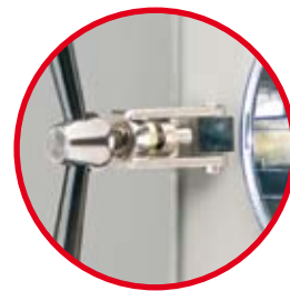
Double locking safety device

Complies with strictest international directives and standards: