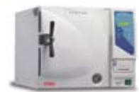
Pre & post vacuum tabletop sterilizers designed to perform class B cycles