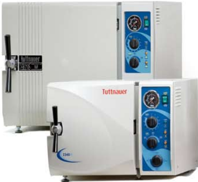
19/23 Liter Chamber Models