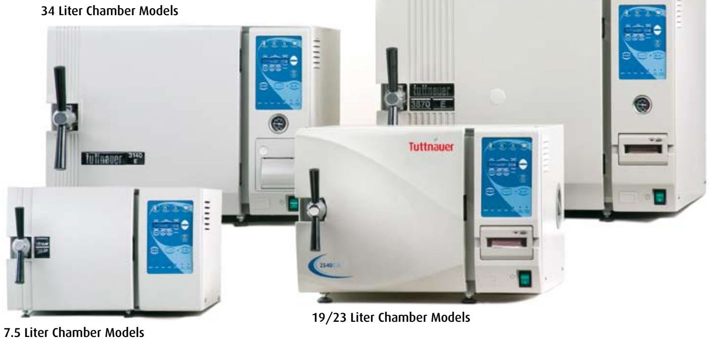
34 Liter Chamber Models