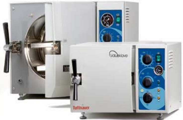
7.5 Liter Chamber Models

Complies with strictest international directives and standards: