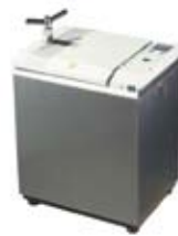
Laboratory autoclaves ranging in size and application