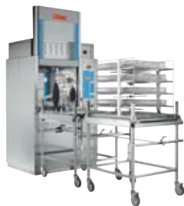
Washers/disinfectors for hospitals and laboratories